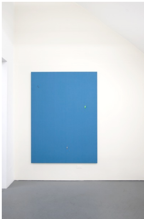
Paul Cowan, Untitled, 2012, Cypress oil in latex paint on wall, Dimensions variable; Courtesy of the artist and Shane Campbell Gallery.

The found fabric, often gaudy, that Cowan uses as color field confuses and momentarily derails my judgment. I can't decide whether I like it or not, then realize that Cowan is humoring my judgments about what it would mean to "like" a piece of found fabric used in a painting and to confront my own immediate bias of whether I "like" something like a color field or not—and how little that partiality matters, or ought to, if I think a painting ought to offer anything more than decorative appeal. The short-circuit game continues in a kind of semiotic meming when I begin to consider the fishhook and its role as an object of interest and speculation. As soon as the fishhook declares itself to be a metaphor, it creates a gentle but quickly unmanageable game of meaning-making. The fishing lures Cowan uses are first an imitation of a fake fish meant to be bait—for whom? As the viewer of the work, I am snared by my interest in the hook, which Cowan uses as a metaphor—a decoy—for painting itself. I have an image of the artist as fisherman, speculating about what will attract the fish. All the theorizing in the world can't answer the riddle about what catches our attention and causes the decisive moment of the audience-art judgment circuit, which Cowan has slowed down through his substitutions.