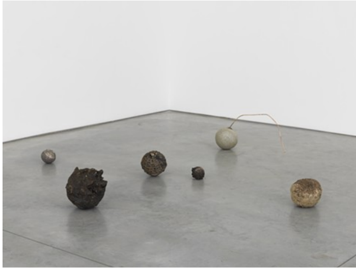
Heikes' "Minor Planets" are made of materials you can't quite recognize.

The unique hybrids Heikes has created illustrate these exploratory thoughts, as he constantly combines things that don't normally go together. He refers to these hybrid balls as "minor planets," a term referring to floating debris in space that is classified as neither a planet nor a comet.