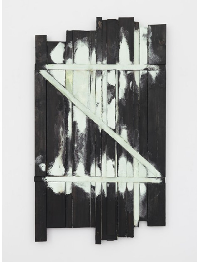
A painting in Heikes' Z series includes a backwards "z," which alludes to the end of language and the passage of time.

One piece in his Z series — a collection of paintings referencing the last letter of the alphabet — appears to be a boarded-up window, dyed black and coated in patches of white salt.