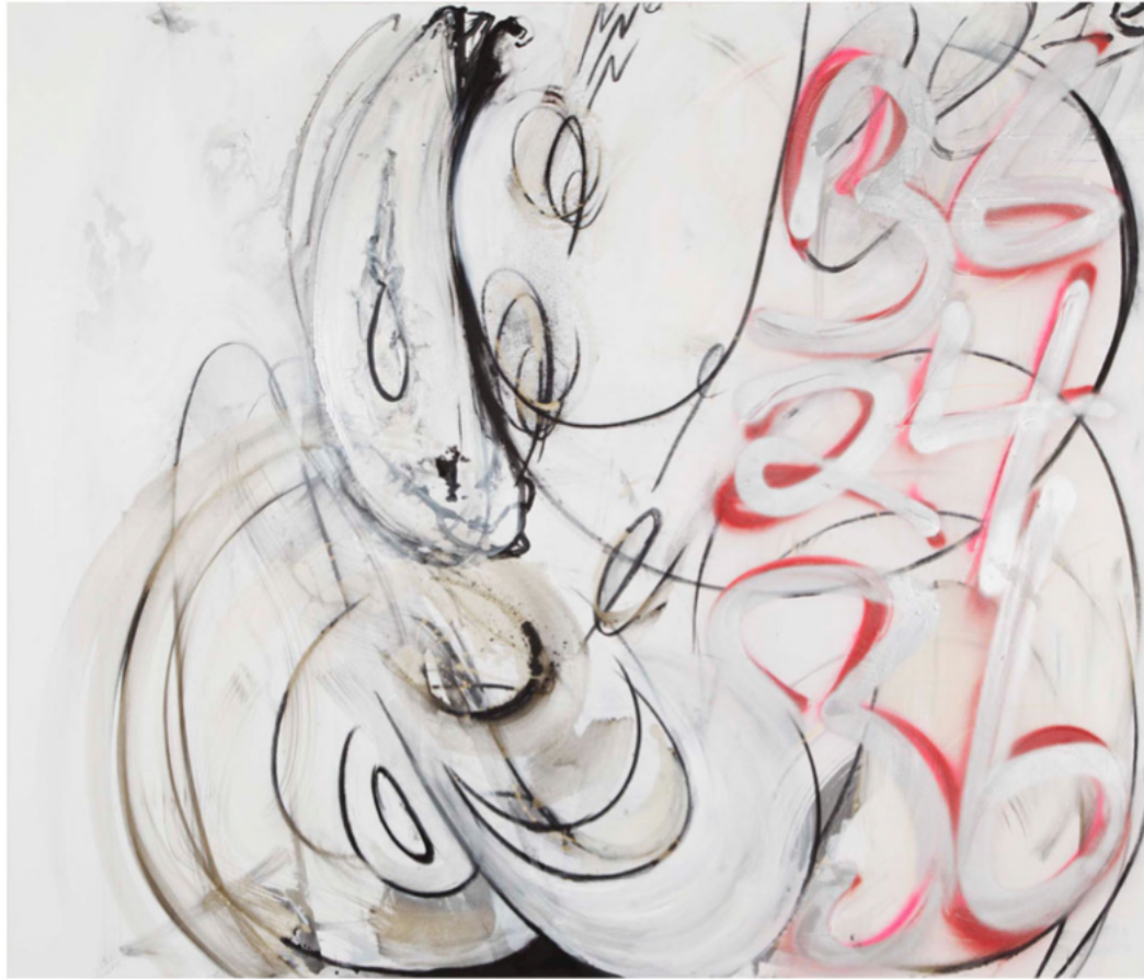
Ideal Proportions: Squeeze—A Winning Hand, 2013, dry pigment, gesso, polymer and oil paint on portrait linen, 72 by 84 inches.

Previous spread, Phil "The Gift" and Jay "Cuts" (Ideal Proportions), 2013, dry pigment, gesso, polymer and oil paint on portrait linen, diptych, 84 by 145 inches overall.