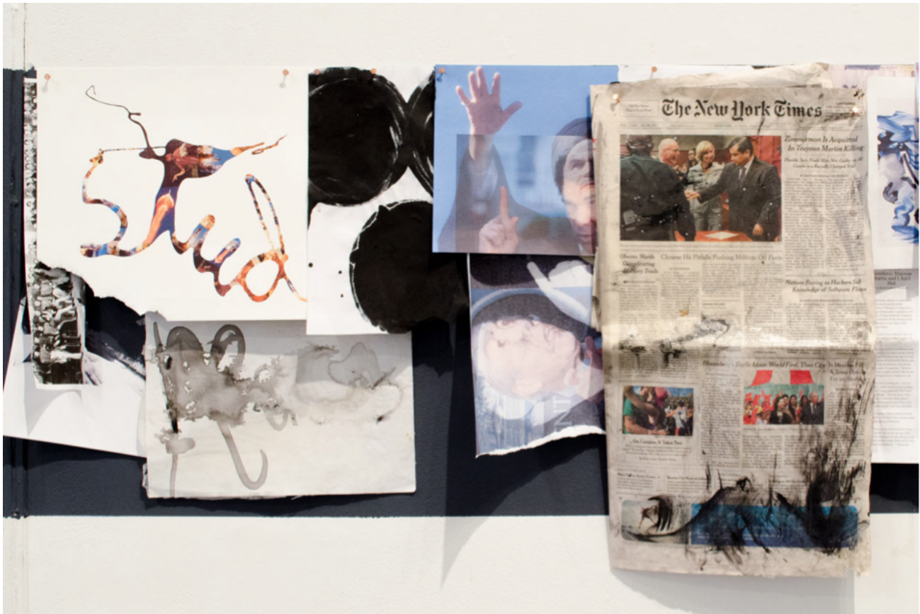
Furtive Gesture (detail), 2013, mixed-medium drawings, prints and photographs on various papers, dimensions variable.

numerologists like Alfred Jensen; a kinship can also be seen with Charles Demuth's ecstatic dream of the figure five in gold. Still, McClelland's turbulent compositions undeniably couple oddly with number problems. On the other hand, they make a comfortable transitive equation to math through the metric beat of music, which has propelled a great deal of her work. She has often cited musicians in her paintings' titles and painted words, and honored them in her brushwork's driving rhythm—a force she considers fundamental to all forms of expression. As McClelland puts it, the link between rhythm and the irrepressible human desire for connection is so strong you can see it in babies throwing a ball back and forth, communicating without a single word.