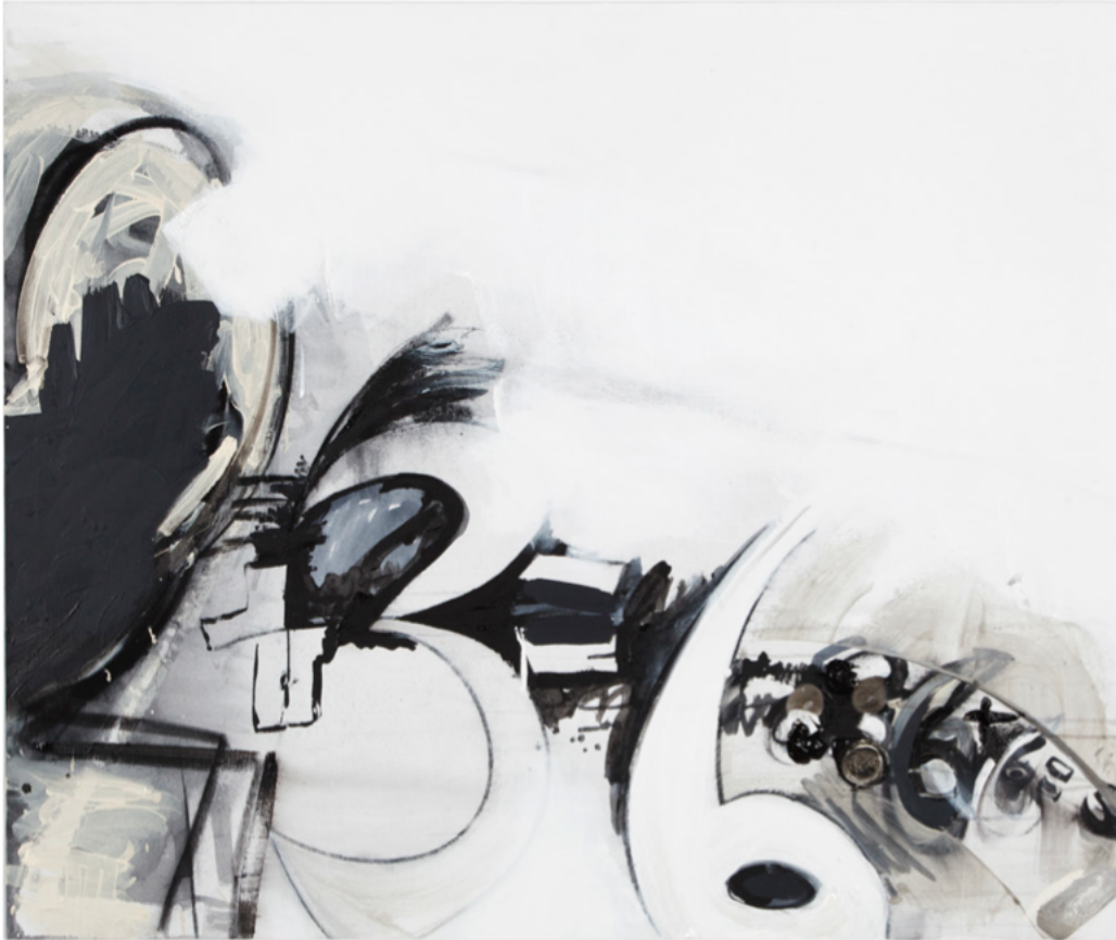
Solutions for Polke (6 + 6 = 5), 2013, dry pigment, gesso, polymer and oil paint on portrait linen, 40 by 48 inches.

graphs are understood to represent lies, gets interestingly complicated when math is telling the story. Is it possible to create compelling fiction with numbers? Just how uninhibited by logic are the irrational ones? Are numbers more abstract than letters or more embodied, arising as they do from a language first counted out on fingers?