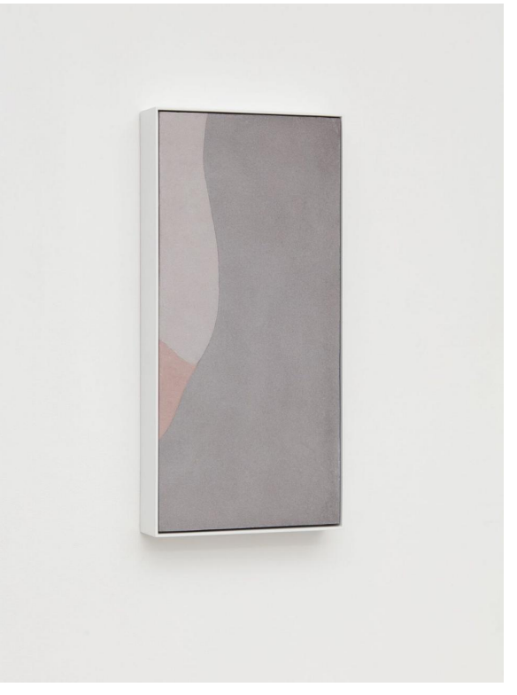
Anthony Pearson, 'Untitled (Embedment)' (2017)

It was the magic of the darkroom that truly enthralled Pearson with the medium. The rush of dipping a piece of film into water and exposing it to light and creating a photograph. As a result, Pearson continuously tried to condense photography down to its most minimal aspects. First he shot portraits, then landscapes with people, then landscapes alone, and then finally boiled down photographs to pure abstractions. Those photographs, or solarized silver gelatin prints, were derived from complex darkroom experiments and processes and slightly echo the photograms of Man Ray or Laszlo Moholoy Nagy or, more recently, the "abstract pictures" of Wolfgang Tillmans. Pearson successfully freed himself from the shackles of the image and illuminated the beauty of experimental chemical techniques. Educated by the iconic fine art photographer James Welling who has always tried to expand understanding of what photography can be, Pearson embraced darkroom production as artistic