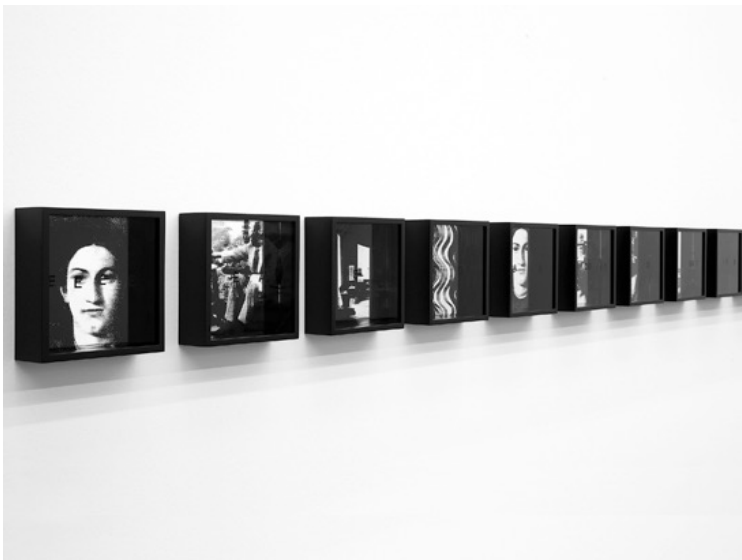
System of Display , 2008-2009, silk screen on glass and mirror, 9 7/8×9 7/8×3 inches each, installation view, 2009. All images courtesy of the artist.