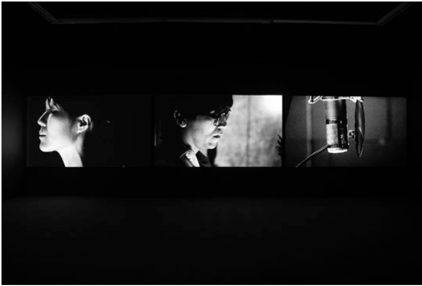
BAND , 2009, three-channel HD digital video, stereo sound. Total running time: 12 minutes, 29 seconds.

TD Does the archetypal form the line and define what's above and below it?