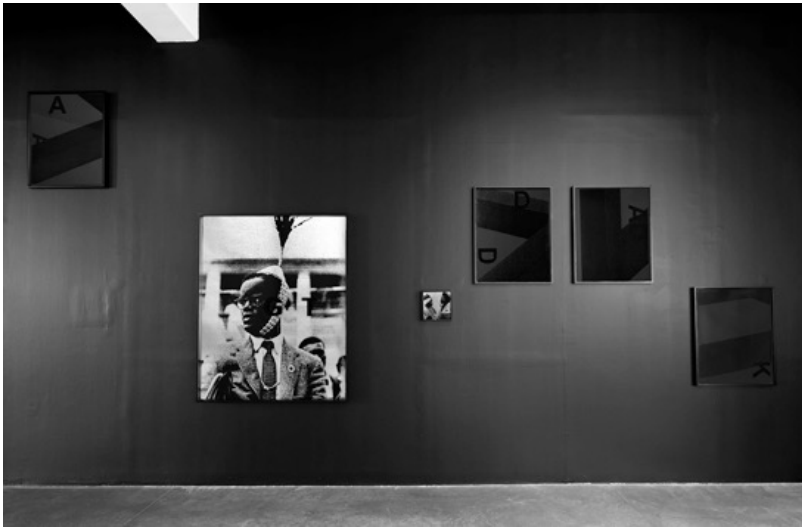
Abolition of Alienated Labor , 2010, various works, installation view, MoMA PS1, Long Island City.