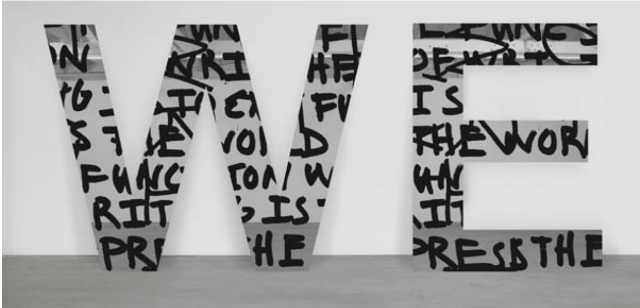
Adam Pendleton, WE (we are not successive) , 2015. Silkscreen ink on mirror polished stainless steel. 46 13/16 × 61 1/2 × 5/8 inches (W) 46 13/16 × 35 5/8 × 5/8 inches (E).