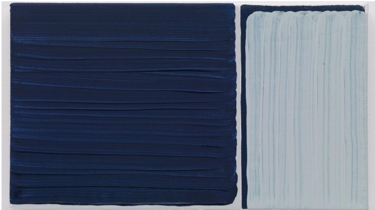
Yui Yaegashi's "Exchange," 2016, oil on canvas, 9.25 inches by 5.5 inches.

At a time when those who shout loudest seem to get more attention than those who speak softly, it's refreshing to come across Yui Yaegashi's whisper of an exhibition at Parrasch Heijnen Gallery.