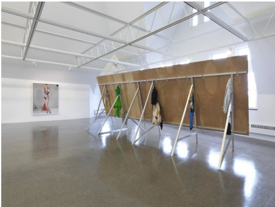
Teen Paranormal Romance Installation View, 2014 Courtesy of The Renaissance Society at the University of Chicago

2021 S WABASH AVE CHICAGO IL 60616 +1 (312) 226 2223