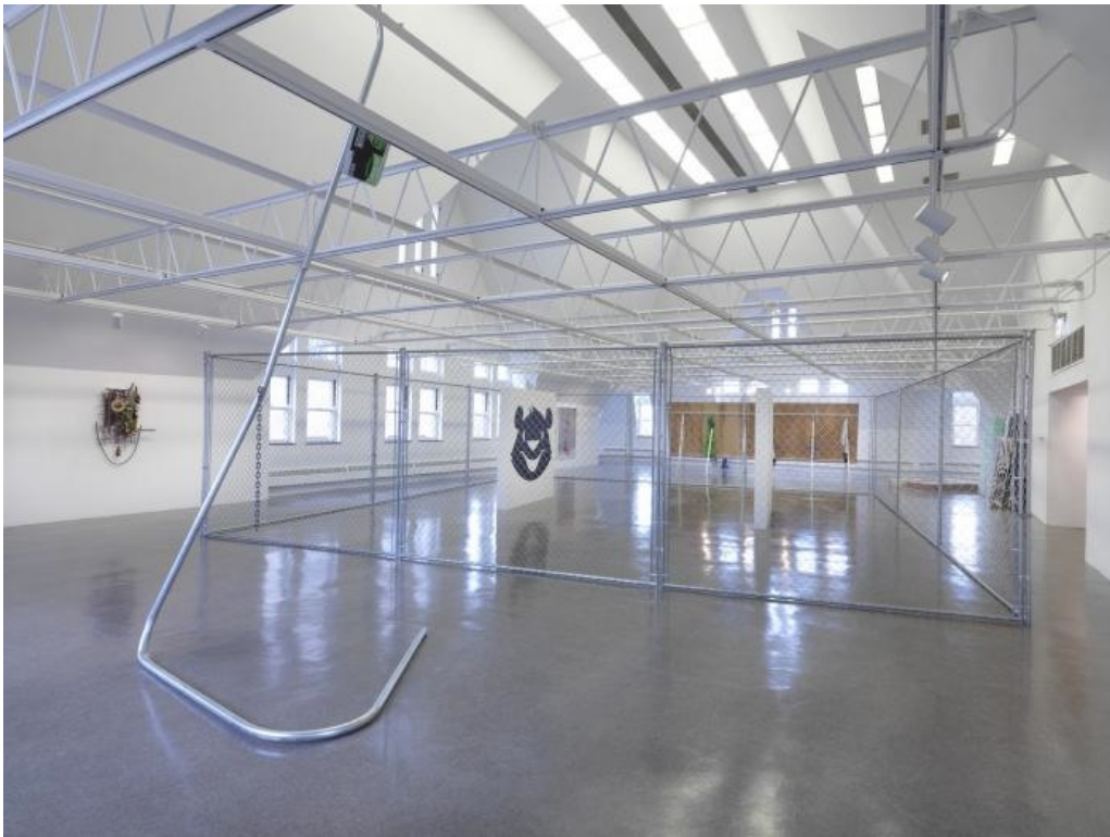
Teen Paranormal Romance Installation View, 2014

Andre Breton in the early twentieth century, and romance as it was explored by Symbolist poets in the late nineteenth century. The work in the exhibition, however, is all contemporary, the oldest piece dating to 2010. “Teen Paranormal Romance” is not an exhibition for young adults, but rather for those of us on the periphery of that world, one that has permeated popular culture. YA literature is not only read by the age group for which it is intended, but by parents of tweens and young adults, educators, family members, and those who are generally interested in the genre. Television shows and movies based on YA fiction such as “The Hunger Games,” “Twilight,” and “True Blood” are indulged in by a range of readers of varying ages. There is not a clear intersection at which these references reside in The Renaissance Society’s show. However, there are moments that point towards the inherent awkwardness of this genre and contemporary surrealism (which arguably doesn’t exist).