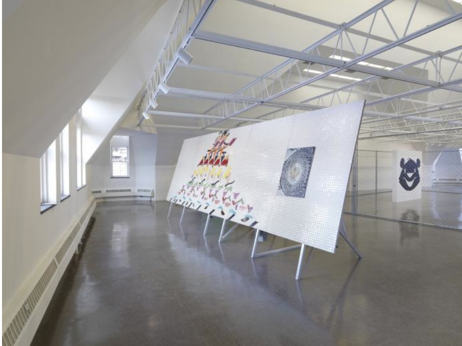
Teen Paranormal Romance Installation View, 2014

serves as a space for colorful coats to hang in a row, much like lockers or designated hooks found in elementary schools for jackets and backpacks.