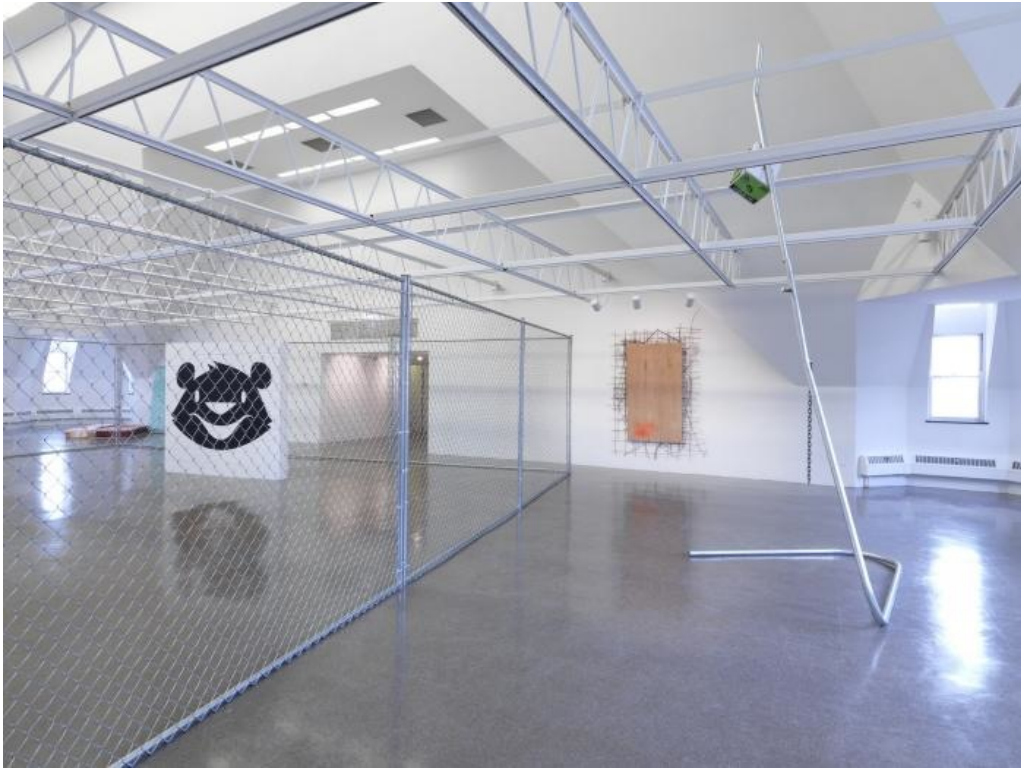
Teen Paranormal Romance Installation View, 2014