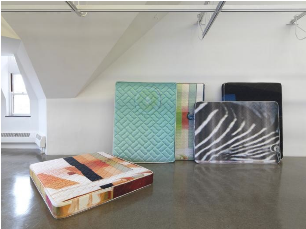
Teen Paranormal Romance Installation View, 2014