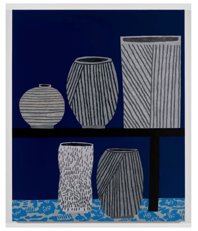
"5 Pots" by Jonas Wood, 2013. Oil and acrylic on canvas, 44 x 36 inches. ©Jonas Wood.

Historically, still-life paintings—the paintings of objects without the human form—are depictions of ordinary life: vases full of flowers and bowls stuffed with fruit. But they can also be infused with symbolic significance. In his last Still Life , done in 1940, Paul Klee used the objects on a table to refer to the allegorical battle of death over life: he was dying at the time. And Picasso painted Still Life with Steer's Skull , 1942, as a commentary on war during the years of Nazi occupied France.