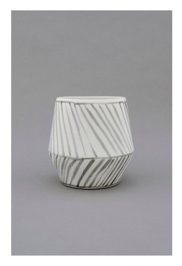
"Stripe 86" by Shio Kusaka, 2013. Porcelain, 7½ x 7¾ x 7½ inches. ©Shio Kusaka.

Of course, when viewers see a show whose overriding image is a vase or a pot, many will think of the Italian 20<sup>th</sup> century painter Giorgio Morandi. Wood's 5 Pots , another oil and acrylic painting, has the same simple composition of a Morandi still life, but while Morandi's paintings were delicate studies done in subtle tones that invoked the solitude of objects, Wood's 5 Pots is a bold and forthright painting, a fellowship of his wife's pots displayed against a rich, royal blue backdrop.