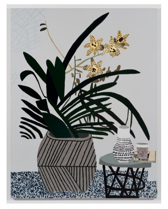
"Still Life with Coffee and Van Gogh Book" by Jonas Wood, 2013. Oil and acrylic on linen, 58 x 45 inches, ©Jonas Wood.