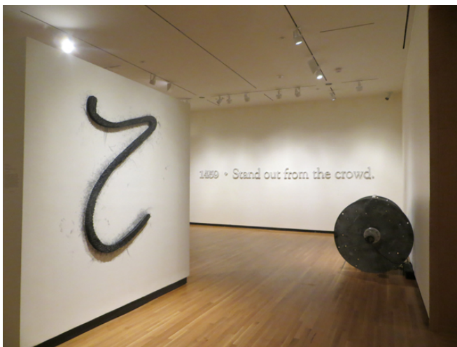
Installation views of two works by Tony Lewis: “Rubber” (to the left) and “1459 • Stand out from the crowd” (on the back wall). Both site-specific drawings are included in the exhibition “Second Sight: The Paradox of Vision in Contemporary Art” at the Bowdoin College Museum of Art.

2021 S WABASH AVE CHICAGO IL 60616 +1 (312) 226 2223